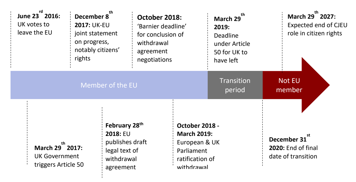
Figure 3: High-level timeline of the Brexit process