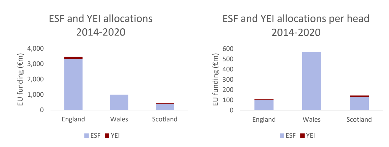
Figure 6: Comparison of nominal and per-head (aged 20-64) funding per GB nation

Source: WPI analysis of National Audit Office xlix